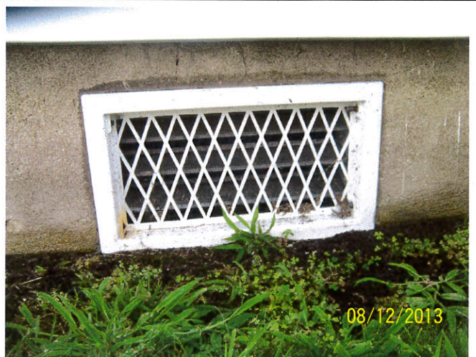
Vent View – Date of Photograph: (See Photo Stamp)